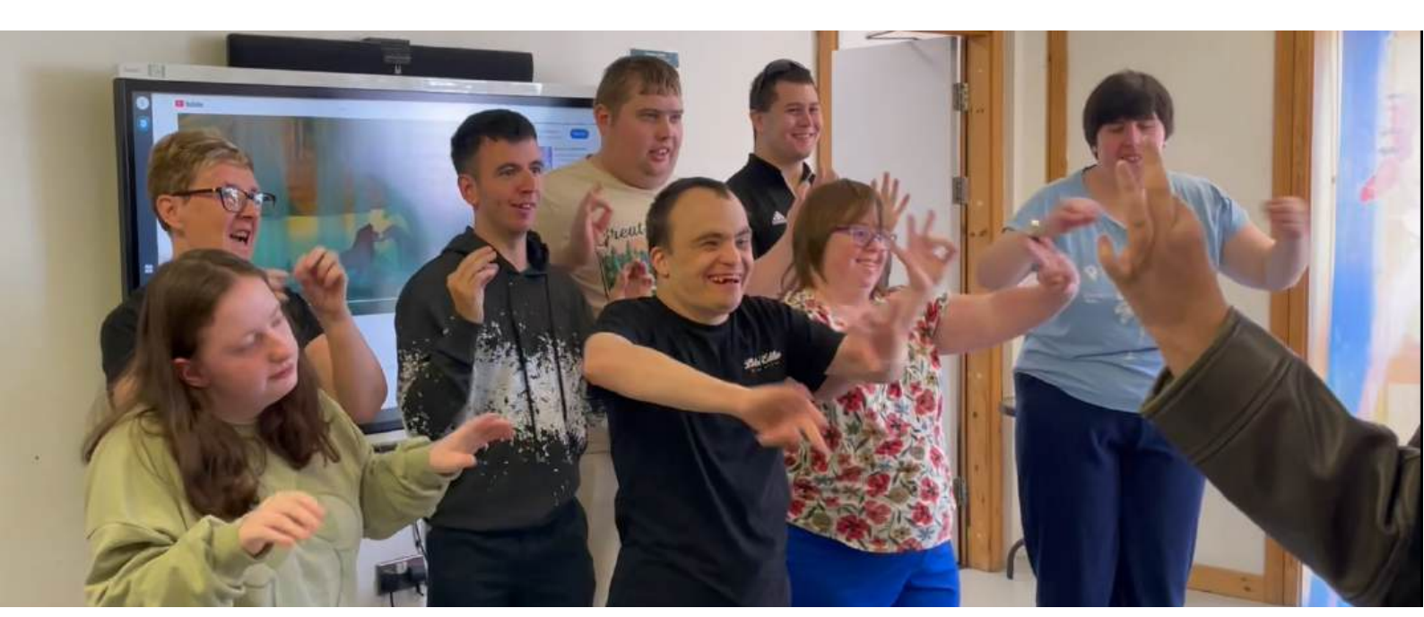
Our performance of 'Can you feel the love tonight'

We have some new people who have joined us recently and we are helping them to make friends. Last week we celebrated World Smile day by making some handprint smiley faces.